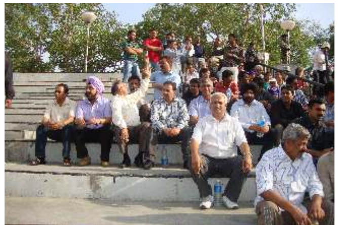
Visit to Wagah Border, Amritsar