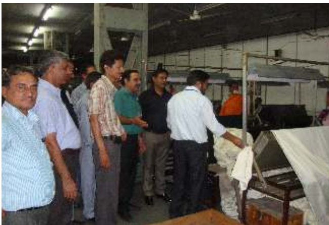
Visit to OCM Mills, Amritsar