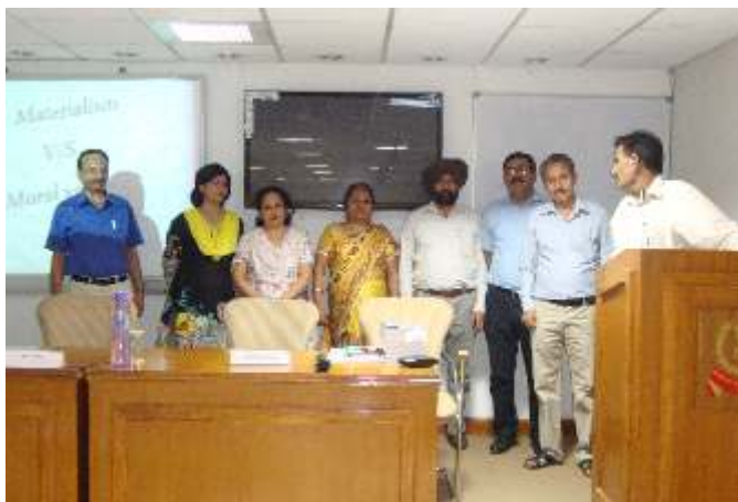
Vikramshila House presenting PPT