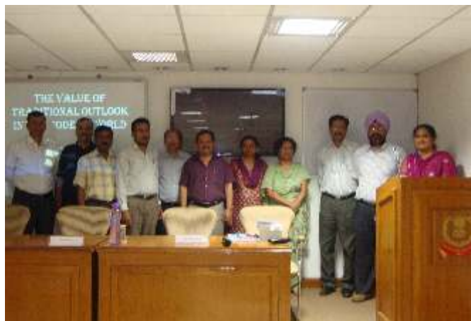
Takshila House presenting PPT