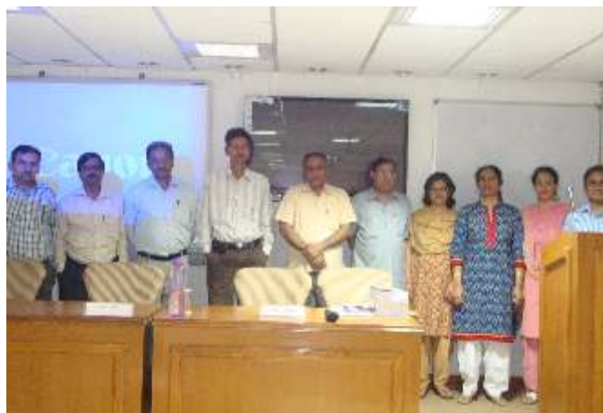
Nalanda House presenting PPT