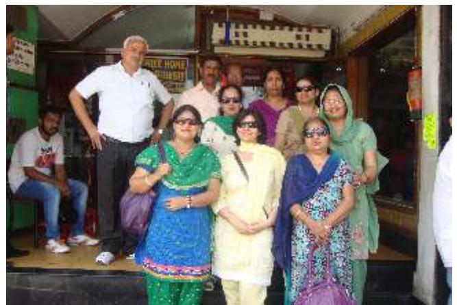
Trainees at Amritsar Market