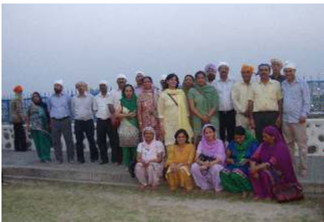
Visit to Gurudwara Kot Puran, Ropar