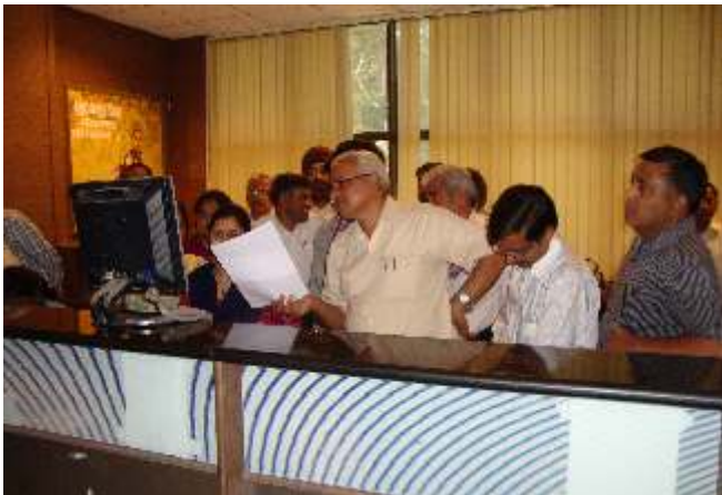
Visit to ASK Centre, Aayakar Bhawan