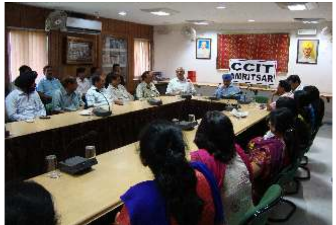
CIT-1 Amritsar having interaction with trainees