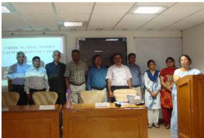
Gandhara House presenting PPT

In order to inculcate team spirit within each house, various tasks were assigned to each house. All the houses were given a task of preparing and presenting a power point presentation on different topics, assigned by the Id. DIT, DTRTI, Chandigarh.